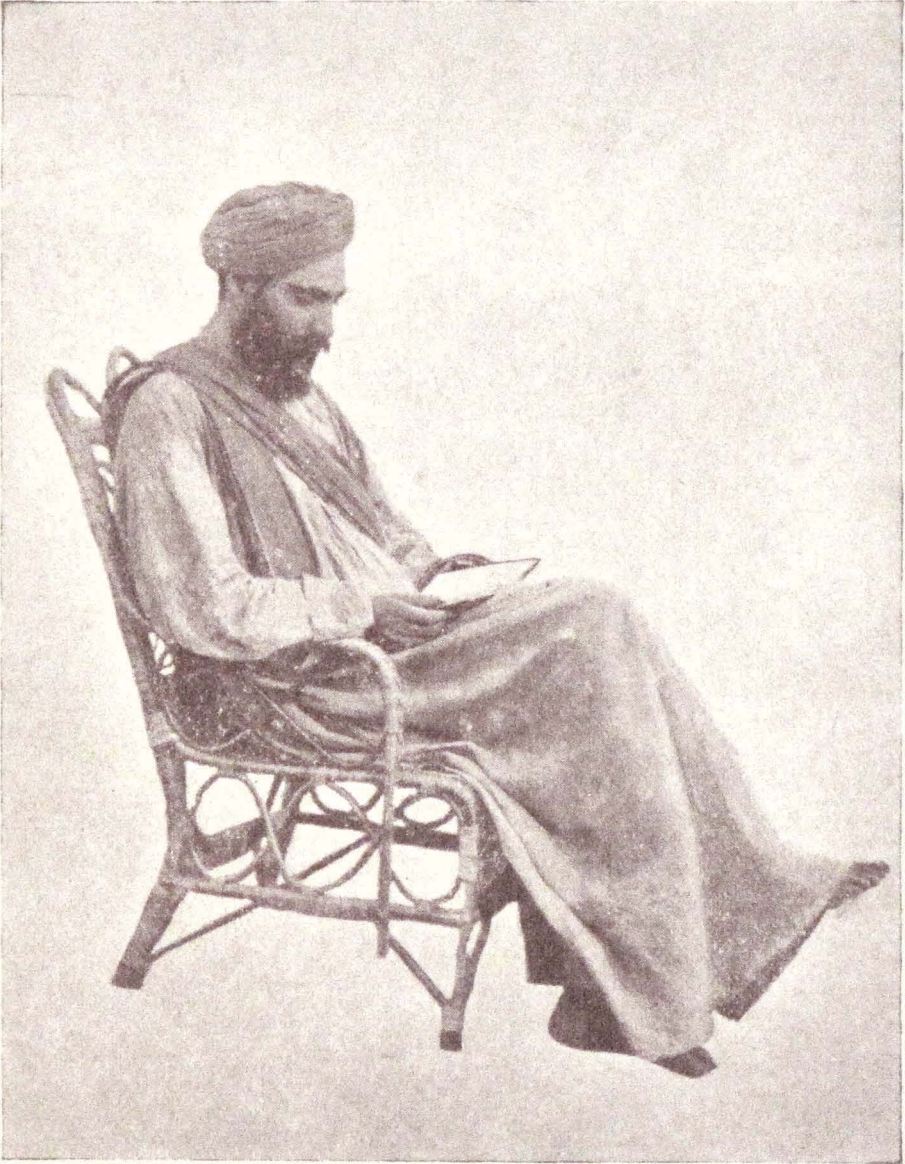
THE SADHU READING HIS NEW TESTAMENT